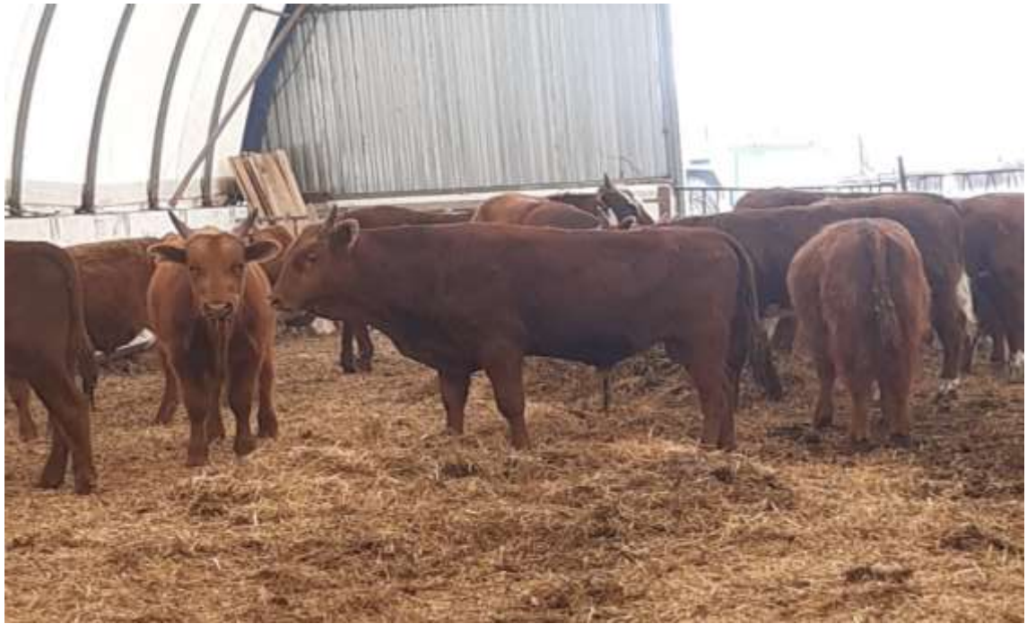
Figure 1 – 12-month-old steers at «Moskovsky» Ltd.

The results of the study showed that the absolute increase in the live weight of young animals depended on their maintenance and feeding. Within 12 months from the moment of birth weight of youngsters of group I was 38,2 kg (10,3%) more than youngsters of group III, respectively, weight of youngsters of group II was 17,2 kg (9,8%) more than youngsters of group IV. Absolute gain of live weight also varied not only depending on the age of young animals but also depending on the time of the year ( Table 2).